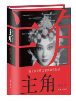
(the book of The Diva)

Her maternal uncle finagled her into the county opera troupe under the stage name "Black Belle Yi."